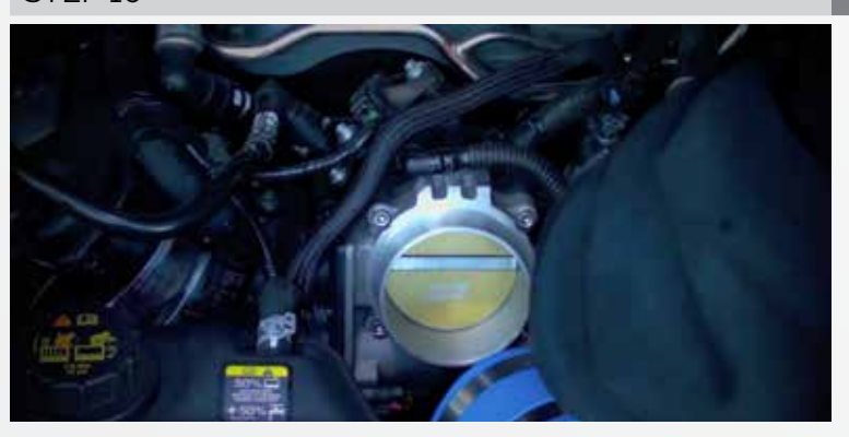
Re-install the air inlet tube and reconnect the breather tube. A little WD-40 or light grease on the inside of the tube may help in this process. Tighten the clamps.