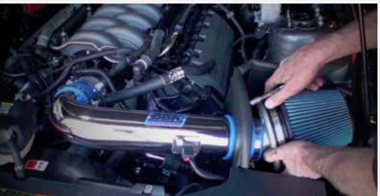
Remove the air inlet tube and set it aside.