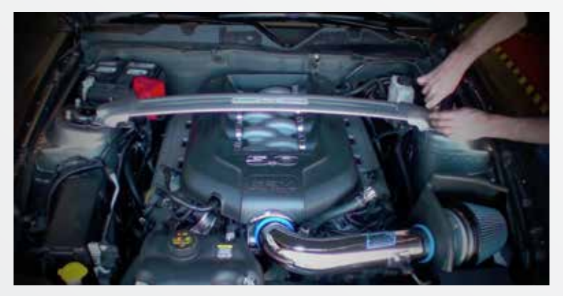
Remove the strut tower brace if applicable.