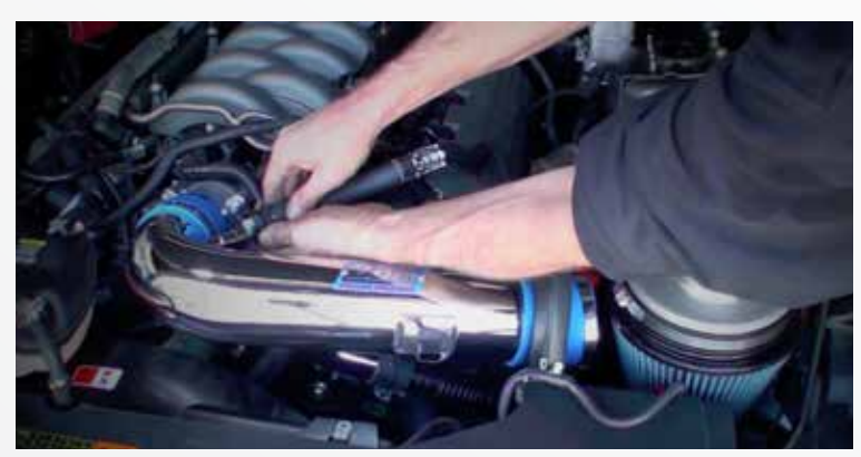
Disconnect the smaller plastic breather tube from the air inlet tube. You can leave the sound tube connected.