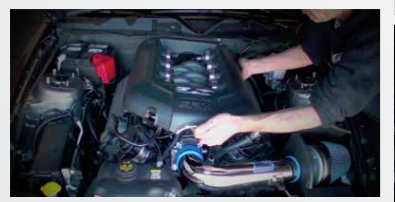
Remove the engine cover by pulling up on it to release its mounting pins from the grommets on the intake manifold.