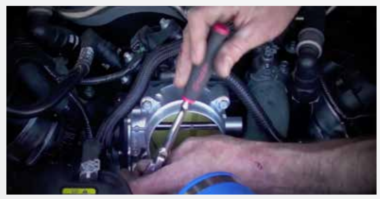
Remove the four mounting bolts from the stock throttle body, as you remove the throttle body, flip it to unplug the motor plug on the bottom.